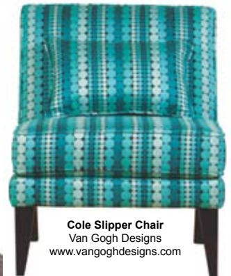
Cole Slipper Chair Van Gogh Designs www.vangoghdesigns.com