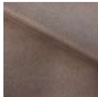
JASPER Joanne Fabrics www.joanefabrics.com