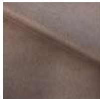
JASPER Joanne Fabrics www.joanefabrics.com