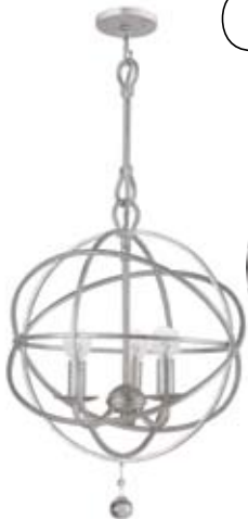
12" 3 Light Mini Sphere Pendant Union Lighting and Furnishings www.unionlightingandfurnishings.com