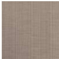
PAT Joanne Fabrics www.joanefabrics.com