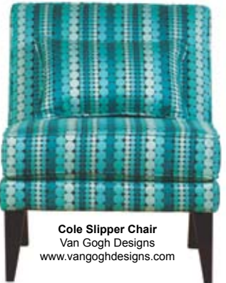
Cole Slipper Chair Van Gogh Designs www.vangoghdesigns.com