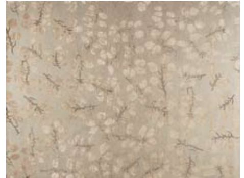
PEMA LEAVES 8x10, Wool & Silk Area Rug ELTE www.elte.com